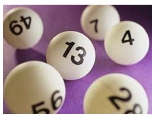
Waldringfield Village Hall Lottery