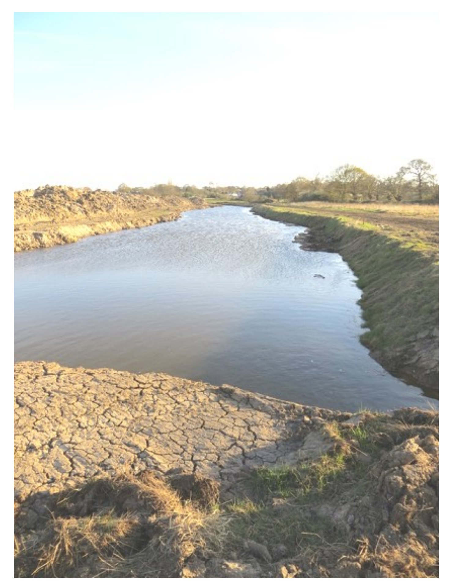
New grassland water-vole habitat on the right bank of the new ditch.