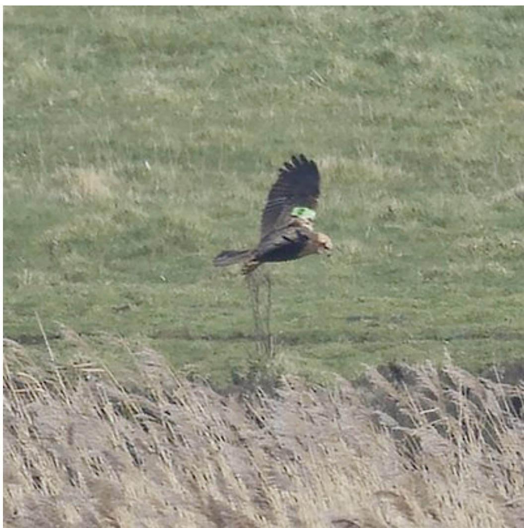
Wing-tagged Marsh Harrier at Kirton Creek/Mill River, early Feb.

Goldcrests have been occasional winter visitors to gardens and have been recorded by several people. Conifers are a preferred feeding habitat where tiny spiders and insects lurk amongst the needles.