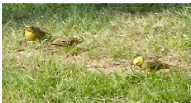
Yellowhammers feeding on lawn.

Yellowhammer 6/3 (1) Mill Rd hedge near Whitehall, 21/3 (8) on field behind sailing club, 26/3 (20) in field to the south of the school, 10/4 (10) feeding for the past week on Ros Burfield's lawn in Mill Rd