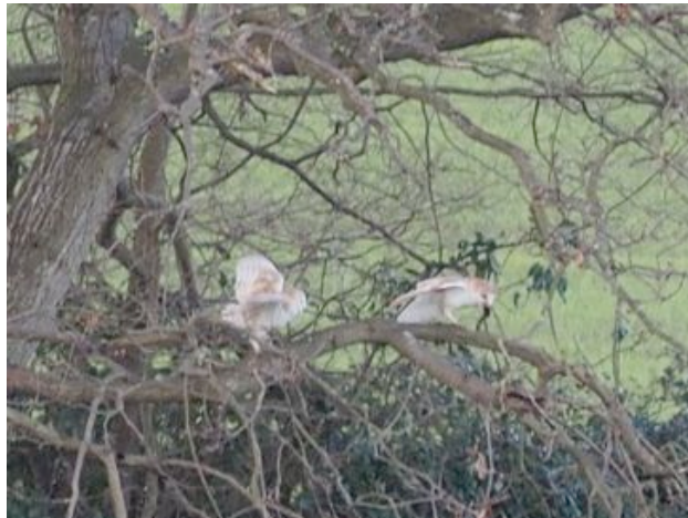
Barn Owls seen passing food 16 th Jan

Barn Owls late Dec and through Jan (1 or 2) seen hunting in daylight in various 'long grass' places around the village.