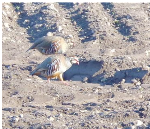
Red-legged Partridge near Chapel crossroads.