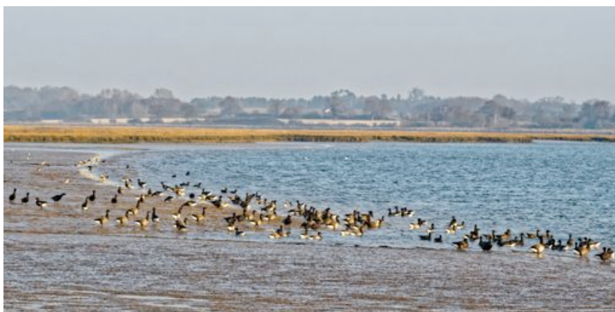
A flock of about 100 Brent Geese arrived at the Hemley shore and pushed the normal waders along

2 Swallows over Kirrawah field , opposite Seven Acres, on the 9 th April and 1 at Hemley on the morning of the 11 th show that migration is under way and, should there be a breeze from a southerly, continental direction, Nightingales and Cuckoos will soon be heard. Chiffchaffs have been calling since the middle of March when 1 was heard winding itself up - ‘chiff-chiff-chaff-chiff’ - on the 15 th March at the reservoir bushes and after that they were heard in all the likely thickets around the village. A Blackcap was heard at the Moon and Sixpence on the 26 th March and now they can be heard in well-treed gardens around the village.