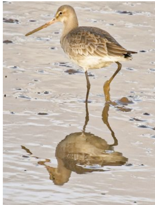
Black-tailed Godwit

Widgeon (10), Teal (20), Redshank (2) mid-Feb to mid-March. This was the typical number of waterbirds on the wetland reserve in the early morning, then numbers increased in the second half of March. On 16/3 to the end of March Widgeon (20), Teal (30), Mallard (4). Then much reduced numbers so that by early April most of the duck had migrated.