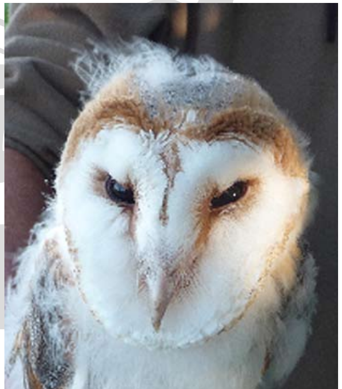
One of Waldringfield's own Barn Owl fledglings