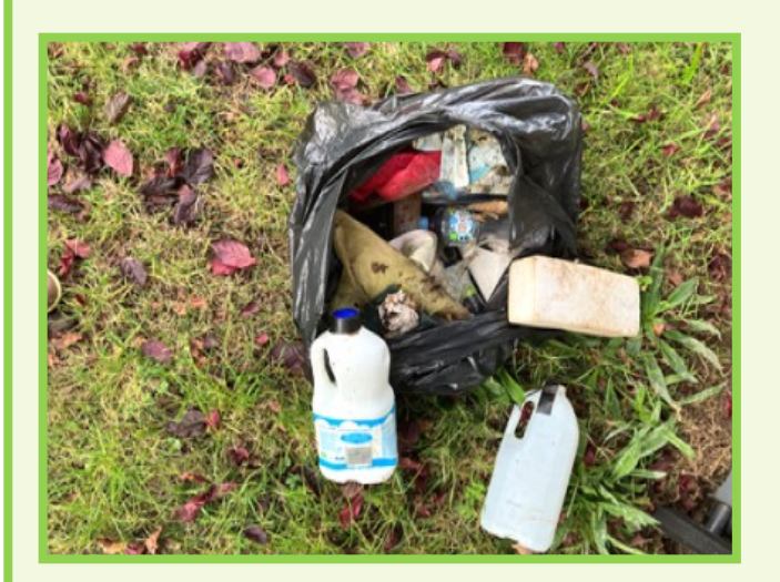
Dinghy park collection

Also a good haul was revealed (and retrieved) when people had taken their dinghies home. Again many thanks to all helpers on the day and through the year.