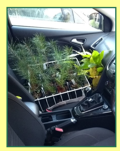
Waldringfield trees off to pastures new. 15 Scots pines in the front seat!