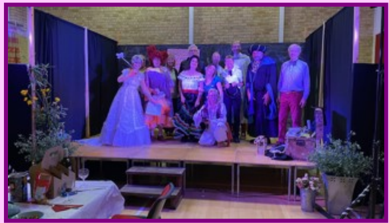
Cast of "Aladdin" 2022

As the summer fades and the days shorten, we all need something to look forward to. Well here is something to look forward to – The Harvest Supper Party! Please put the date in your diary – Saturday 28<sup>th</sup> October! (The Village Pantomime will be held as a separate event). Further details will be forthcoming on 'waldringfielders' and at the September coffee mornings. Last year's event was a sell-out so be sure to book your tickets early!