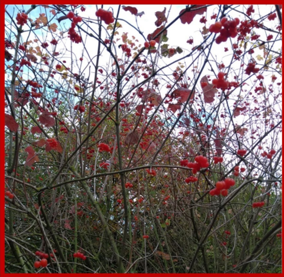
Guelder Rose berries seen after the dark red leaves fall

As it turns colder we are seeing autumn tints arriving and the Church Field is looking very beautiful on misty mornings and evenings. The fruits provide a feast for autumn visitors like migrating blackbirds and thrushes such as redwings and fieldfares. There are plenty of sloes this year and the blackberries were good earlier on.