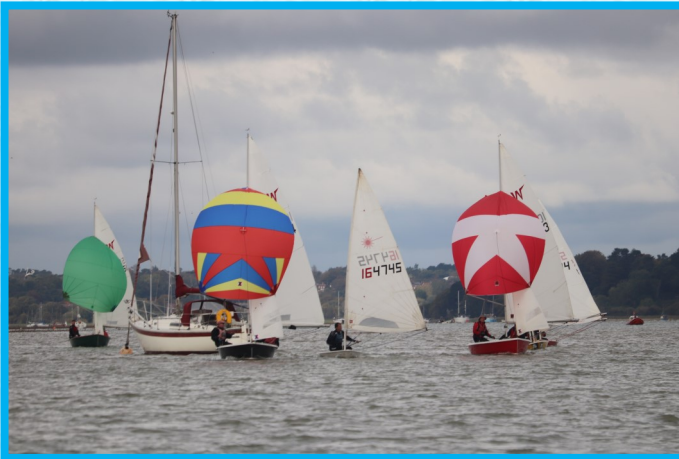
Waldringfield Sailing Club afloat on 17th October