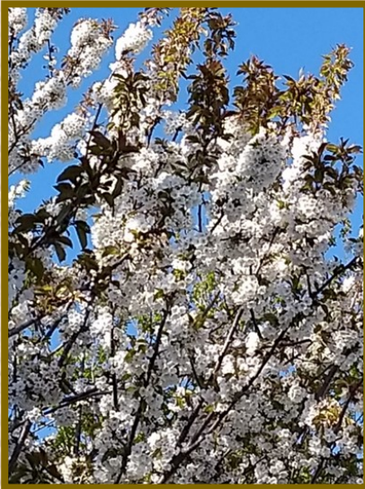
Wild cherry in flower