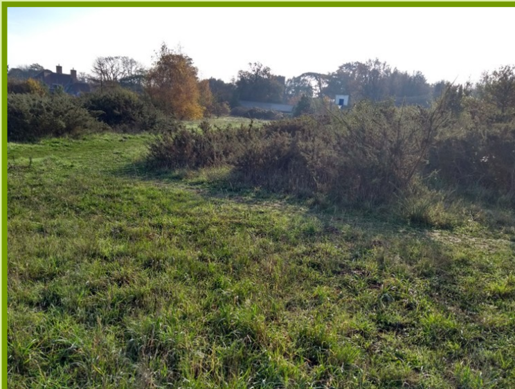
Misty Autumn morning at Church Field