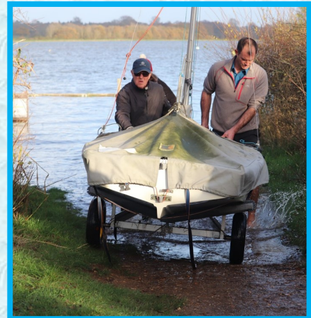
Water water everywhere...