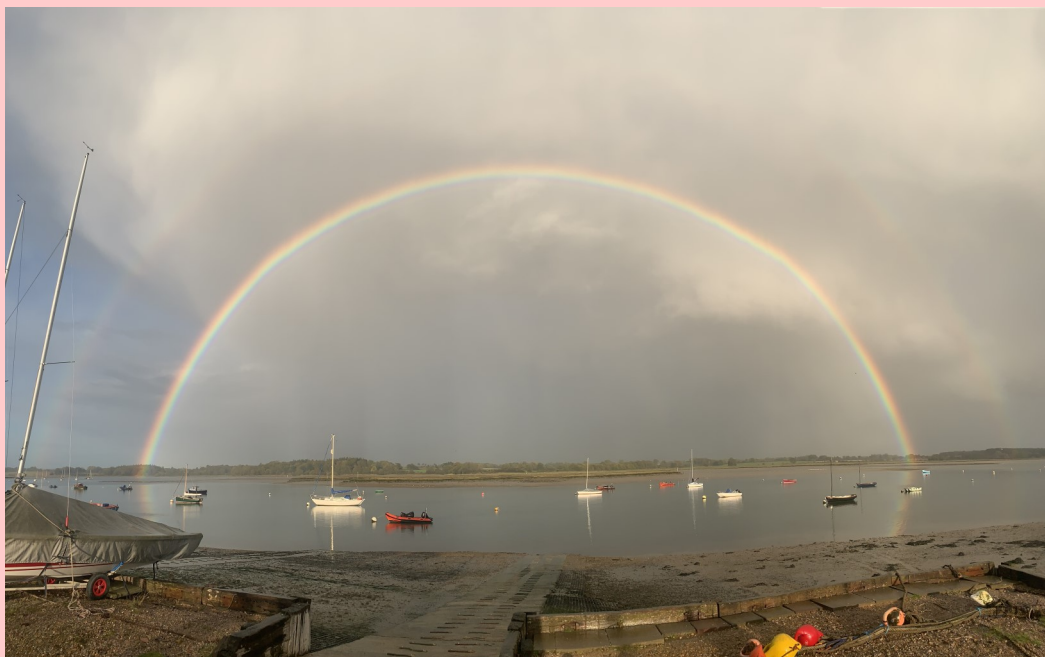
Somewhere over the rainbow – a beautiful image captured by Charlie Bland.