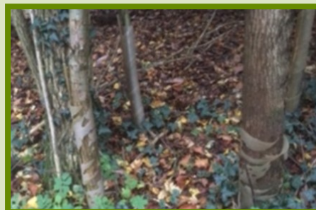
How the tree guards break up and degrade

The Rubbish Walk from the Heath Crossroads up to the roundabout generated, of course, much more than the other two roads into the village – this stash (just one of three collected by a dozen volunteers on 16 th October) contained a rotating sofa, a sheet, a facecloth and enough red and white plastic straws for quite a party, along with countless drinks containers – estimated to be about 90% of national roadside rubbish by City to Sea!