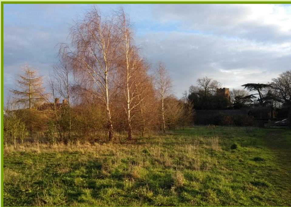
Church Field, taken on 2nd January 2021