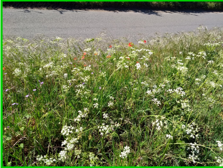
Verge of Ipswich Road allowed to grow during the pandemic.

As a result of Covid, many councils were forced to reduce grass cutting to protect their workforces, who were often depleted or shielding, electing to only cut roadside visibility splays and attend to major growth essential to public safety. In many places this allowed a profusion of wildflowers to flourish. Management has to follow this up by removing the long growth when it is eventually cut.