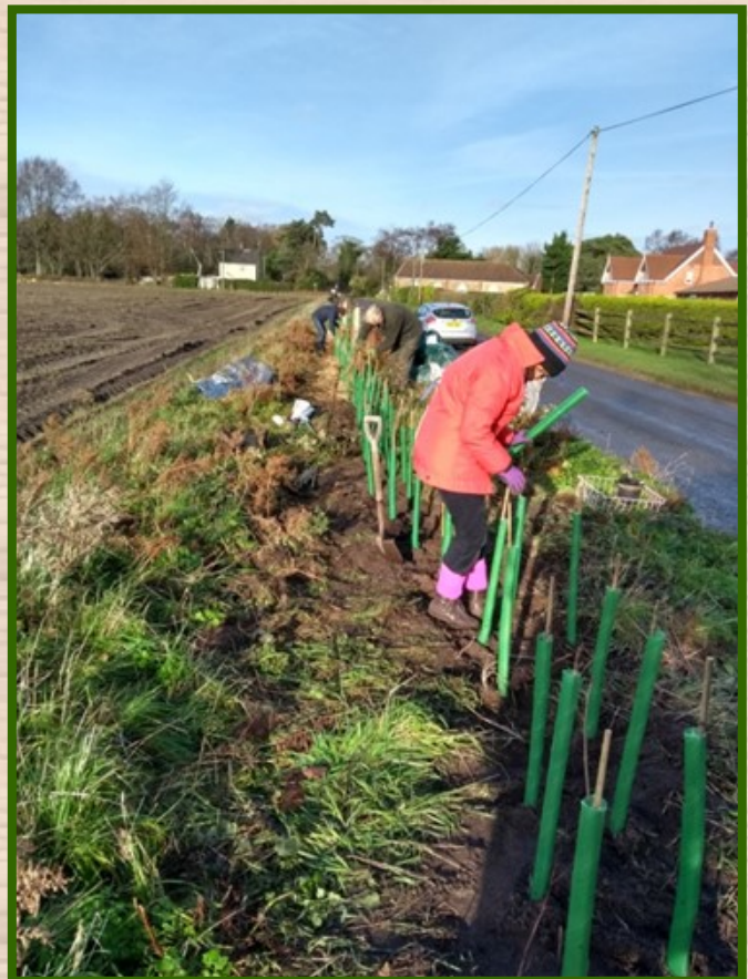
Socially-distanced hedge-planting on Newbourne Road

Christine Fisher Kay, Tree Warden, 01473 736384