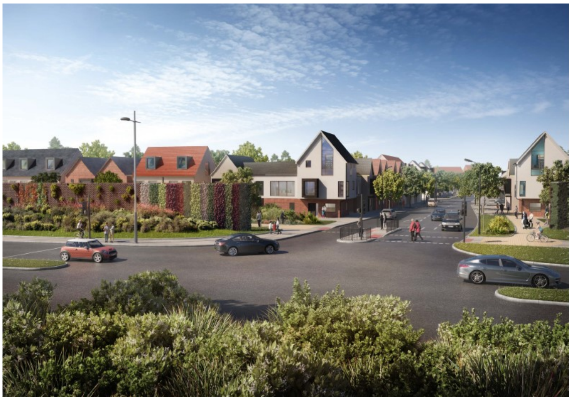
Artist's impression of the new A12 T junction ©CEG .