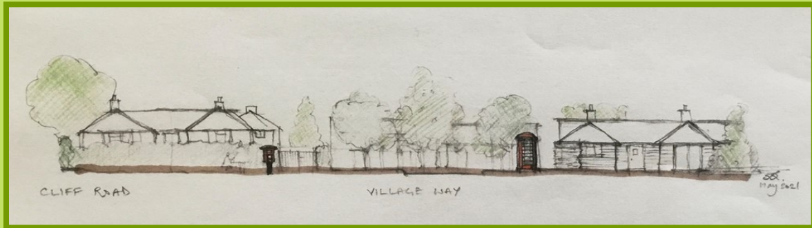
Artistic impression of new street scene

We are delighted to announce that Suffolk Coast and Heaths Area of Outstanding Natural Beauty have awarded a Sustainability Grant to move, refurbish and fit out the redundant Mill Road phone box. It will be moving to a new home in Village Way, on the verge adjacent to Cliff Road and No19, where it will balance the street scene complimenting the post box on the opposite side.