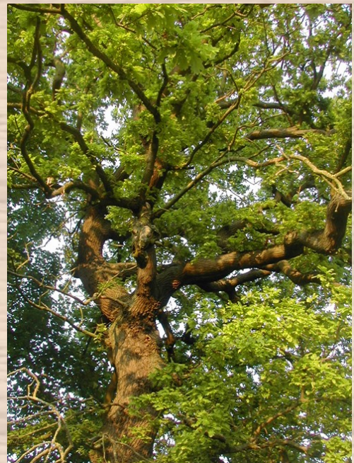
Oak Tree in our garden

The Queen's Green Canopy (QGC) is a unique tree planting initiative created to mark Her Majesty's Platinum Jubilee in 2022 which invites people from across the United Kingdom to "Plant a Tree for the Jubilee." (quote from the website). From October new plantings can be dedicated to the Canopy and plotted on the website map. There is a lot of information on this website for anyone interested and especially for schools and teachers.