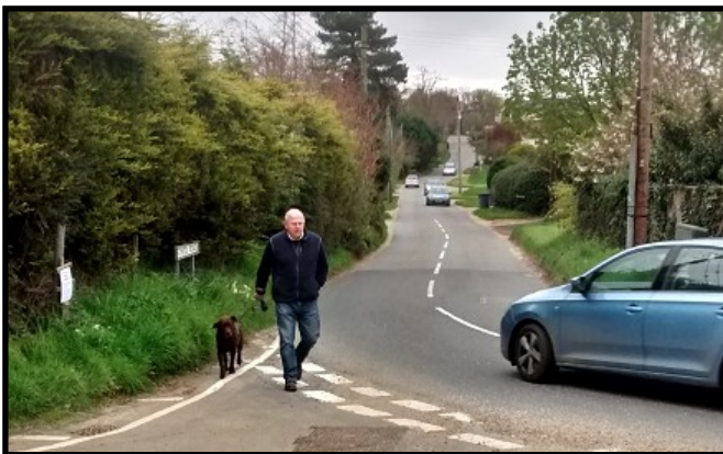
Happily, the on-coming cars were not 10 seconds earlier!